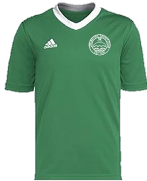
U8/10/12 * New lower price £15.75*