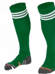
£5.83 (not adidas but much better!)